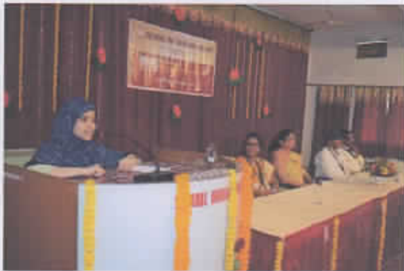
Feedback of students regarding workshop