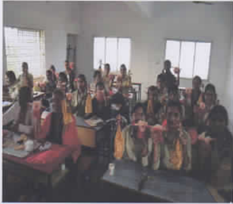
Different types of puppets made by students