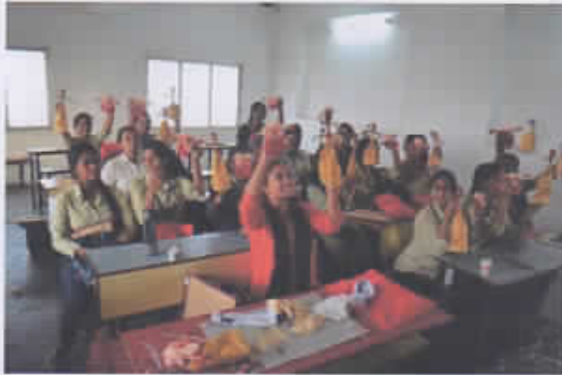
Students enjoying the workshop of puppets